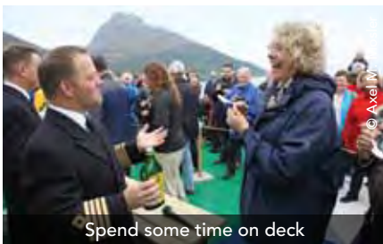
Spend some time on deck

In fall you can see the sprinkling of early snow on the highest peaks, framed by the blue sky and almost ethereal light