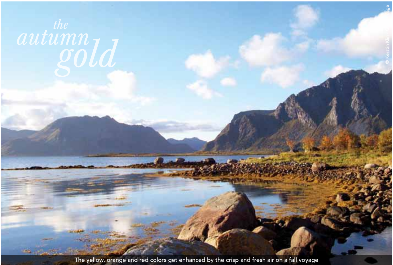
The yellow, orange and red colors get enhanced by the crisp and fresh air on a fall voyage

In fall you can see the sprinkling of early snow on the highest peaks, framed by the blue sky and almost ethereal light