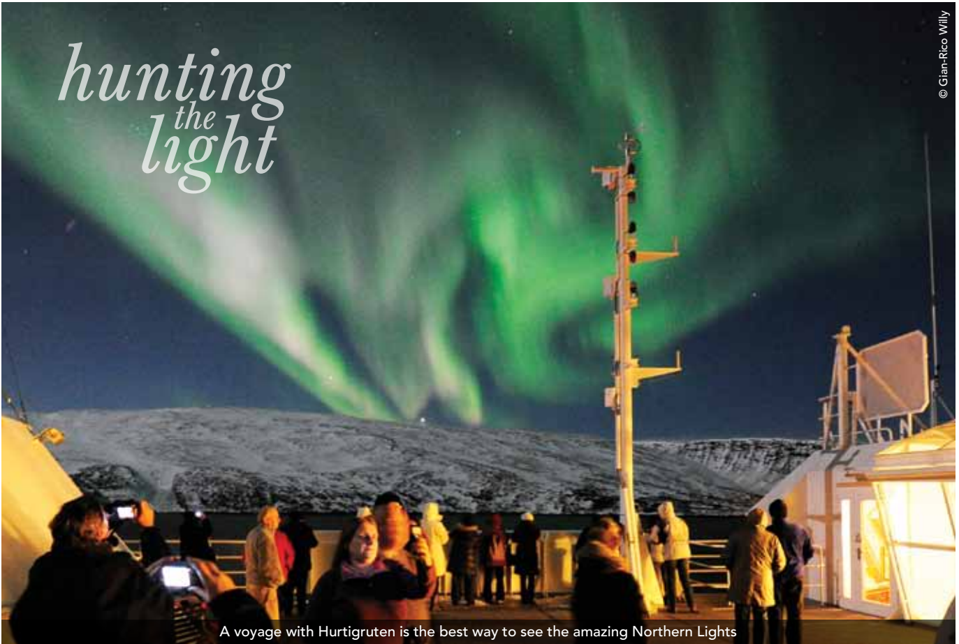
A voyage with Hurtigruten is the best way to see the amazing Northern Lights