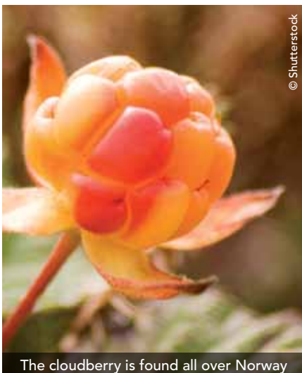
The cloudberry is found all over Norway