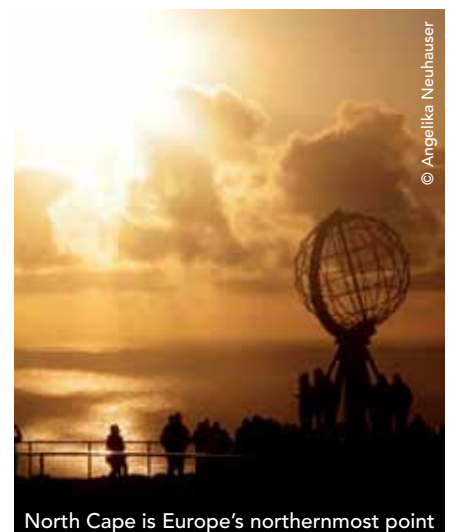
North Cape is Europe's northernmost point