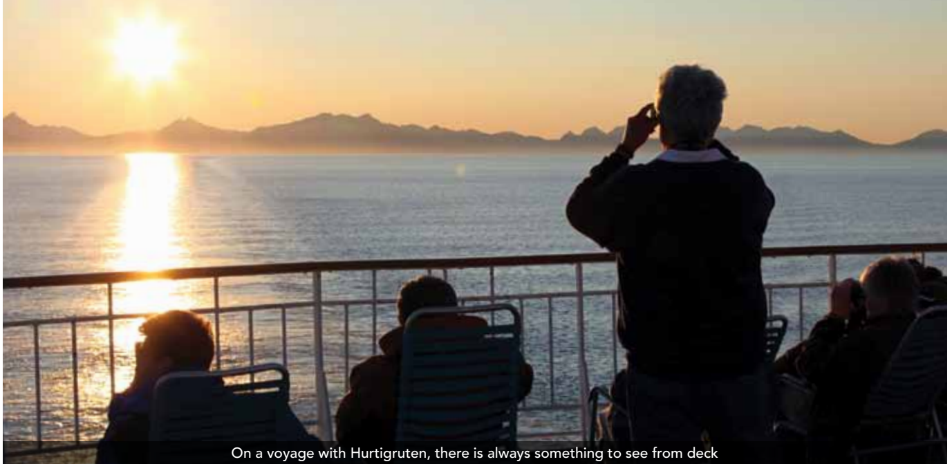
On a voyage with Hurtigruten, there is always something to see from deck

24 hours of daylight makes every Norwegian "night" a joy to behold